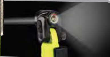
Dual Beam Model Offers Wide Work Beam Or Narrow Spot Beam